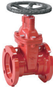
MECHANICAL JOINT (MJ)