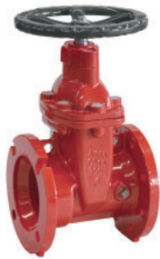
MECHANICAL JOINT X ANSI FLANGE (MF)