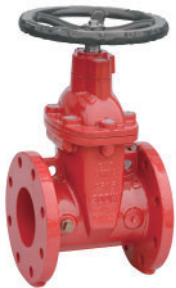
ANSI FLANGE (FF)