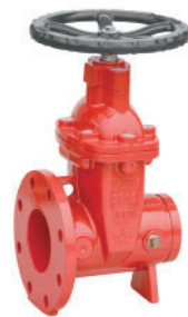
GROOVE X ANSI FLANGE (GF)